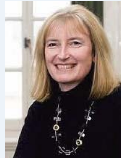
Dr Sarah Wollaston MP (Conservative)

Totnes constituency has a proud history and it can have an even better future with more people in work, better paid jobs, more affordable housing, better transport and an NHS that has the resources and time to care.