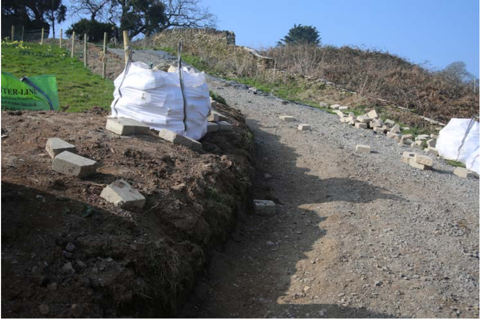
The temporary access—or acceleration zone