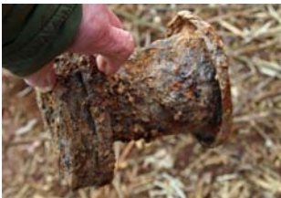
Remnants unearthed from the new footpath - propulsion outlet on the left.

The date of a public meeting will be confirmed soon but 14 April at 7.30 in the Parish Hall is probable.